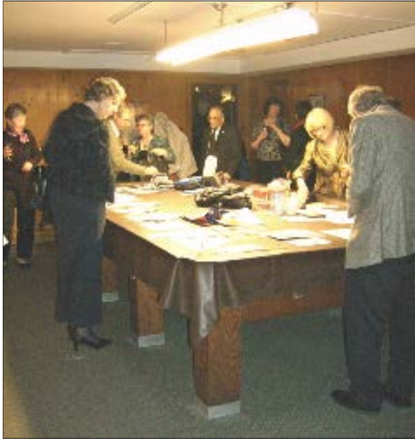
Guests browsing the auction items