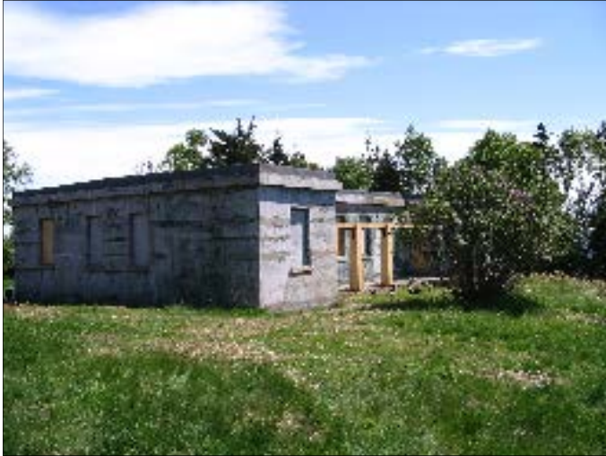
Fort Hugonin Today