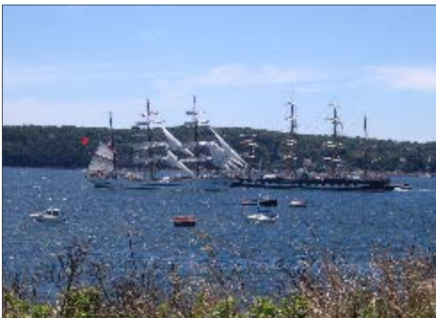
The Portuguese Sagres meets the Russian Kruzenshtern just off Hugonin Point, McNabs Island during Tall Ships 2009 Parade of Sail July 20, 2009. McNabs Island offered the best view of these magnificent sailing ambassadors.

Location: Meet at Murphy's on the Water, Cable Wharf, Halifax Waterfront before 10 a.m. Space on the boat is limited and available on a First Come, First Served basis.