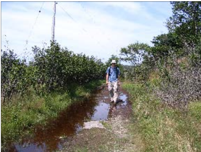
Jon Cusick, Friends of McNabs Island Trails Committee Chair, walks through a wet section of Garrison Road near Maugers Beach.

$250,000 may seem like a lot of money, but this is only one quarter of the estimated cost to rebuild the trails on the island. Although rebuilding Garrison Road could easily swallow up all of our trail money, we want to fix up other popular trails too.