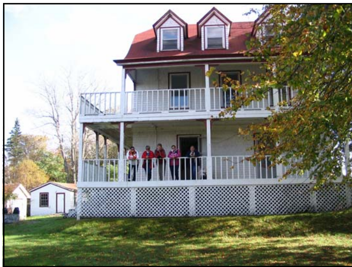
Conrad house open for visitors